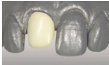
Coping with layer of high-fluorescent Lava™ coping modifier.