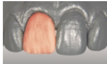
Cut or scrape back to the size of the dentine core. The mamelon tips will be at about the same level as the adjacent teeth.