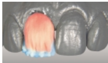
Extend using two incisal materials (Enamel and Enamel + Clear).