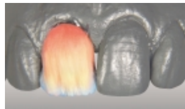
Apply mamelon materials consisting of framework modifiers and Stain colours or Magic Intensive Shades in a thin layer.