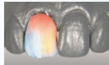
Complement the shape using alternating layers of incisal materials.